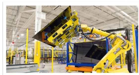
First Solar Manufacturing Plant in Toledo

NOIC recently gathered the four Ohio Innovation Hubs for the second 2025 Innovation Hub Summit, along with Ohio Department of Development staff and NOIC Board members. The summit covered updates from each of the hubs, as well as an overview of recycling optimization in Northwest Ohio, a discussion around the possibility of sharing data between hubs and best practices for doing so, and a panel focused on bringing more capital into the hubs network.