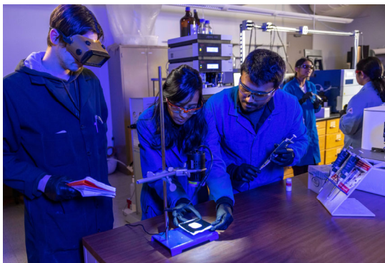
UToledo Student Research Participation

significant damage to solar installations, and as the frequency of severe weather increases, so does the need for stronger, weather-resistant solar glass. Research in this area will address glass edge strengthening and laser/glass interaction, led by First Solar in collaboration with UToledo and BGSU.