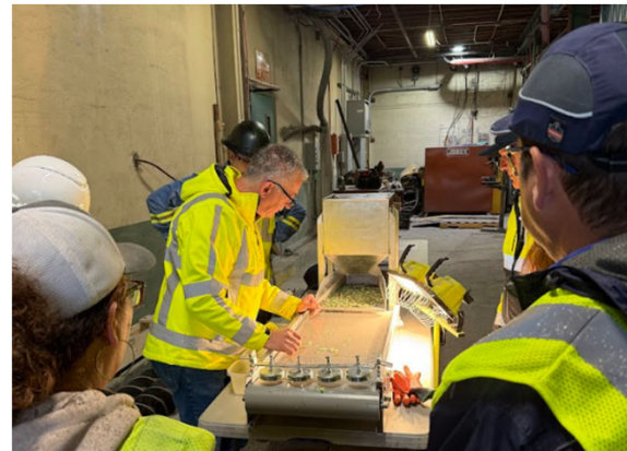
O-I Brockway & Crenshaw Cullet Testing

The project recently commissioned its first study regarding C-Si solar panel glass handling. Additional research will soon launch with a focus on windshield recycling methods.