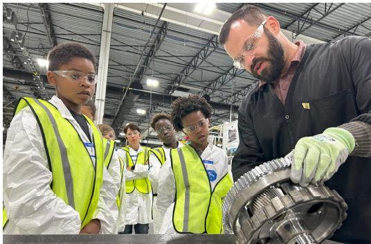
TPS Manufacturing Summer Camp Tour

The team has also begun supporting professional development pathways for K-12 teachers, as training educators can impact exponentially more students than we can reach through summer camps directly. Two materials science educator programs will occur this summer, where in-depth glass and solar industry knowledge will empower teachers to implement the materials science experiment kits with their students and build upon those concepts in classrooms across the region.